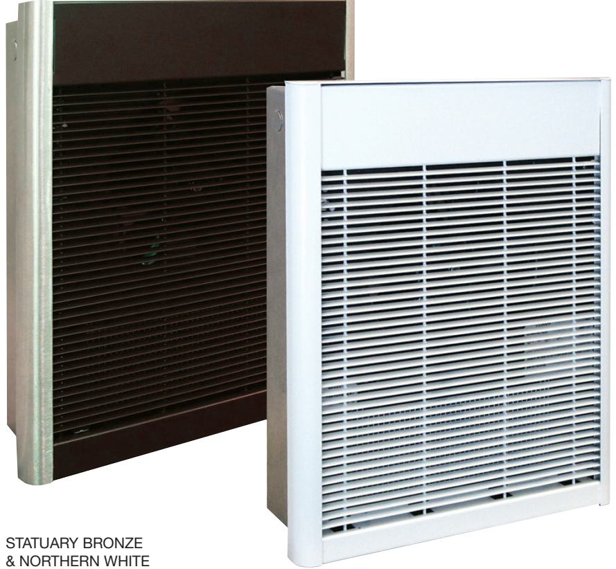
STATUARY BRONZE & NORTHERN WHITE