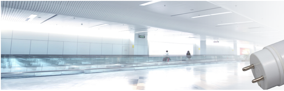
Application illustration only, subject lamps not used in photo.