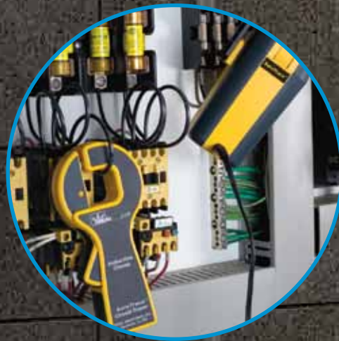
Inductive clamp allows you to induce a tracer signal on to the cable without affecting the low voltage signals on the circuit.