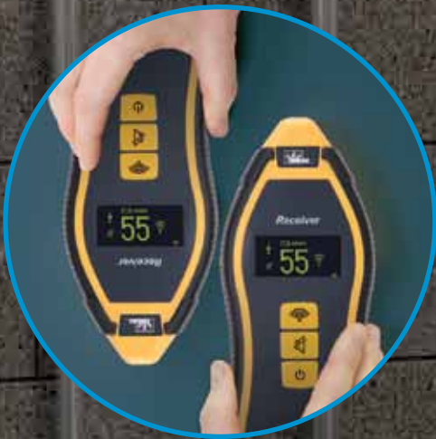
Revolutionary technology in the RC-959 rotates the display in 90° increments so that you always receive an upright reading. Even when the receiver is pointing down, you can keep up.