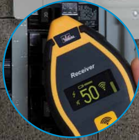
Receiver identifies the correct circuit to which the transmitter is connected.