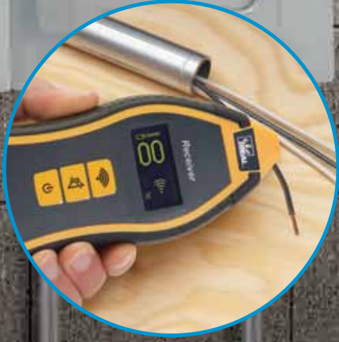
Individual wires can be sorted, opens can be located and shorts can be isolated.