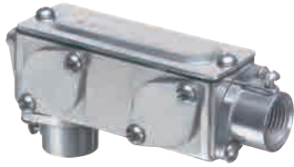
930 ships as LB